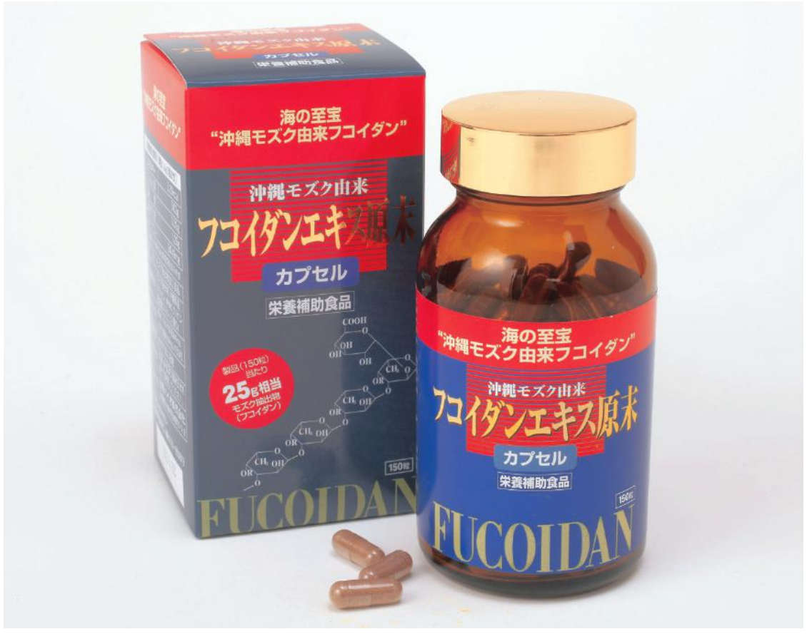
figure type is capsule.

Yaeyama Minsa woven cloth Fucoidan Extract Powder Capsules have been a very popular long seller around the world since Fucoidan has first garnered attention for its healthy properties. The product is used by 100% Okinawa-made Mozuku (seaweed) that has been carefully grown in clear ocean and under the sun. This product